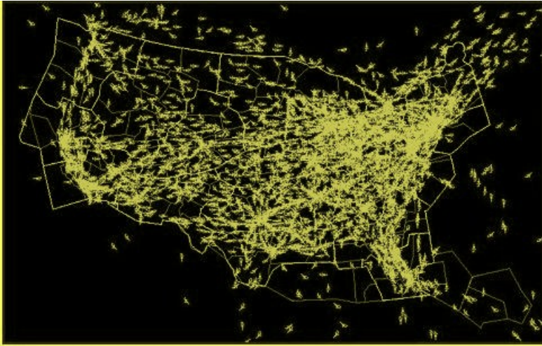
REGULAR U.S. FLY ZONE